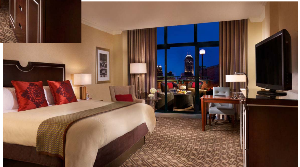
Premier City View