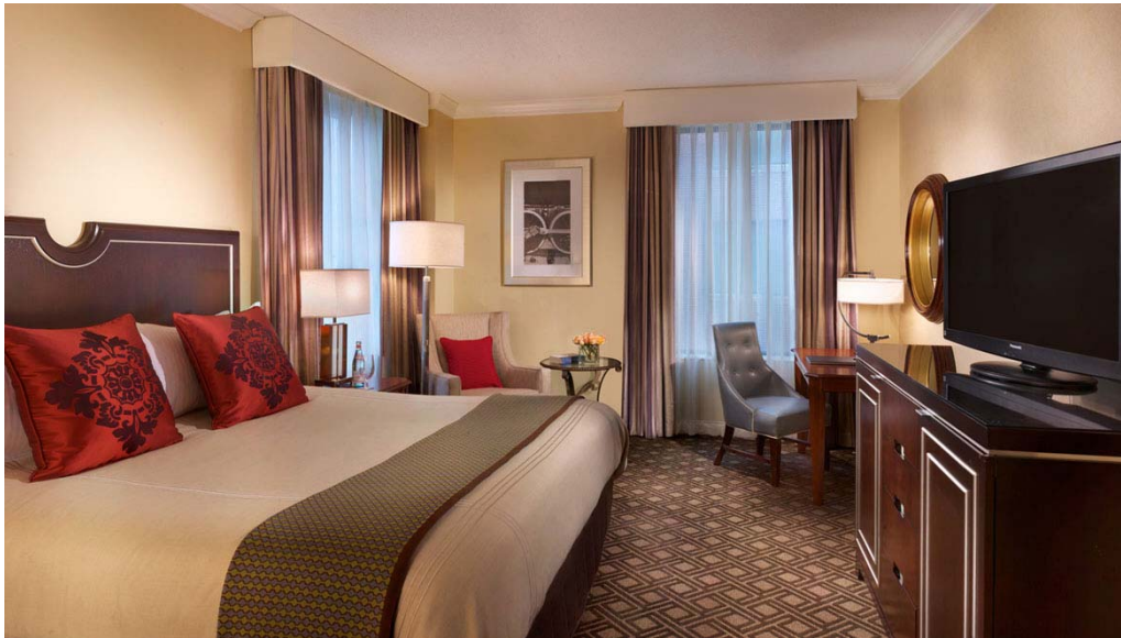
Standard King Room